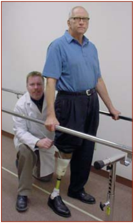
Working closely with your Prosthetist is essential.

P erry Prosthetics, Inc. is committed to providing the individual amputee the highest quality of care so that he or she may re-enter and regain his or her place in society as an employee, employer, teacher, student, parent, child, or loved one.