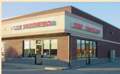
Our new 2,200 square-foot facility

Call our offices to arrange for a tour of the facility and meet with the staff.